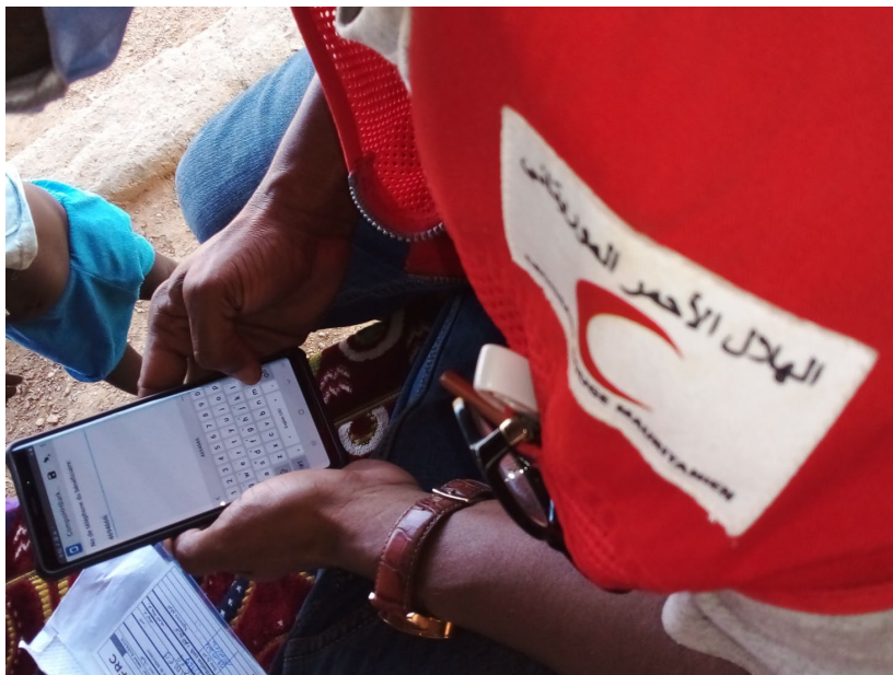
MRC volunteer conducts post-distribution monitoring survey with smartphone.