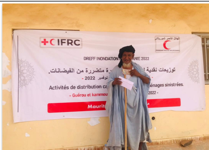
Immediate assistance to basic needs through CVA. Guerou, Source: MRCS